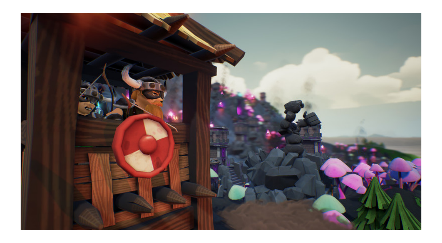
Valhalla Hills: Two-Horned Helmet Edition Offline Activation Code And Serial

Download ->->-> <a href="http://bit.ly/2NEhYtU">http://bit.ly/2NEhYtU</a>